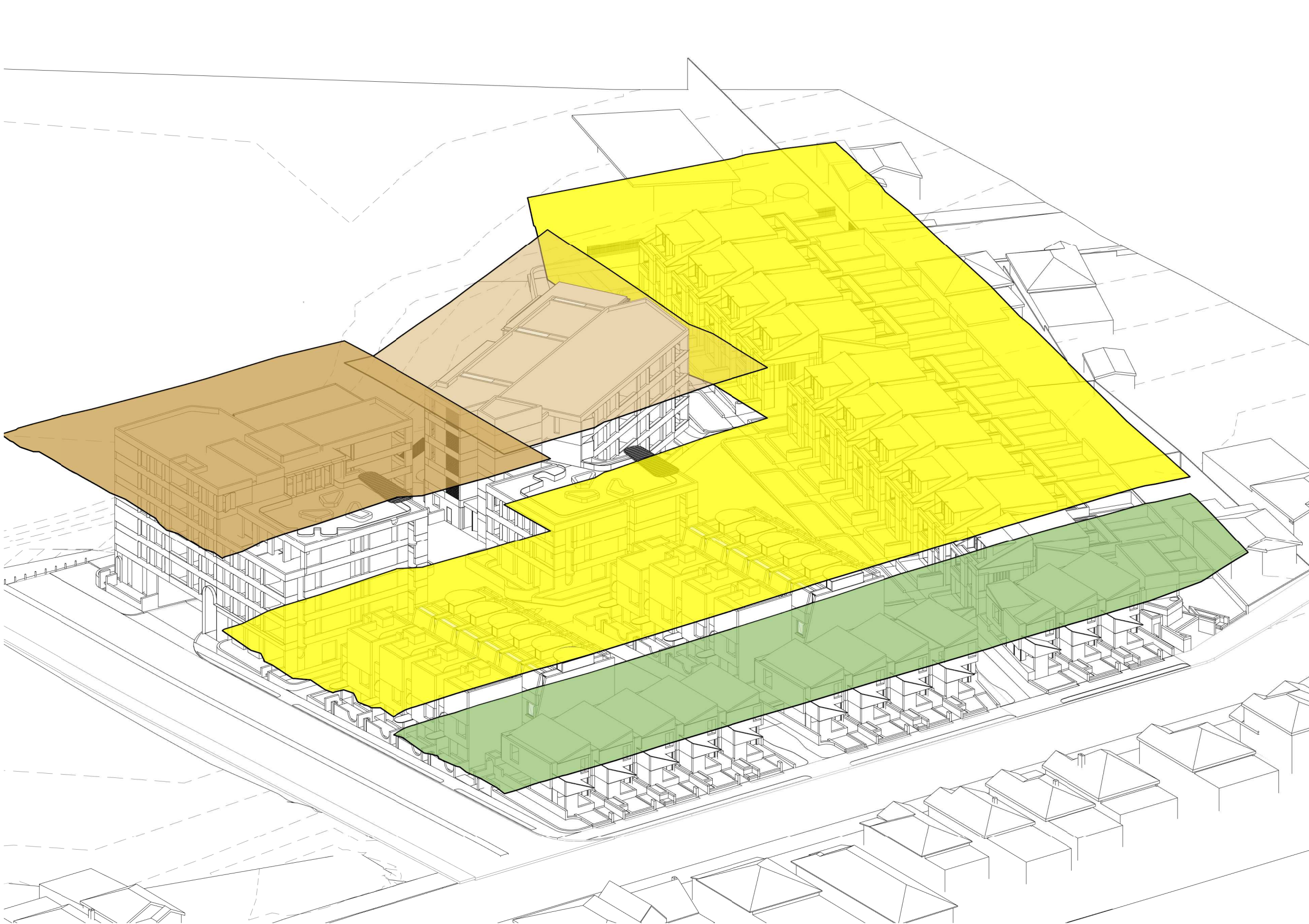
LEP AXO 01